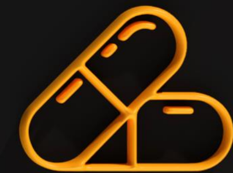
Capsules & Tablets