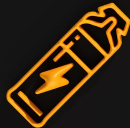
Gels & Shots