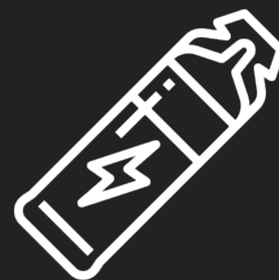
Gels & Shots