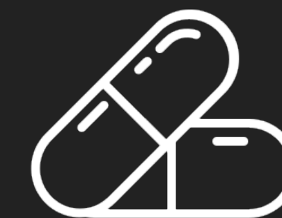
Capsules & Tablets